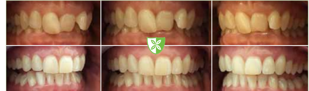
Before and after Invisalign treatment