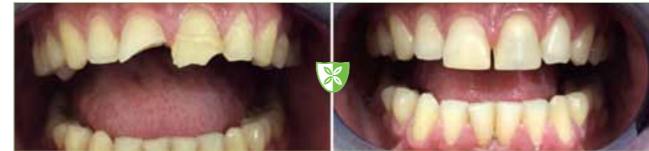
Before and after Composite Filling