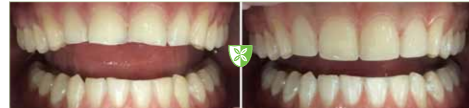
Before and after Composite Bonding