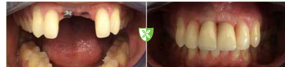
Before and after Dental Implants