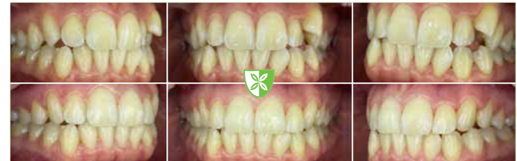
Before and after CFast treatment