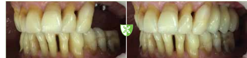
Before and after Dental Implants